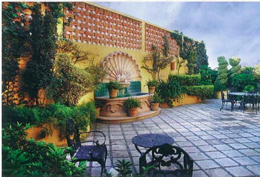
Top: The 20,000-square-foot Villa Estrella Mar ($7.2 million) near Puerto Vallarta. Above: The patio of a home in Guanajuato.